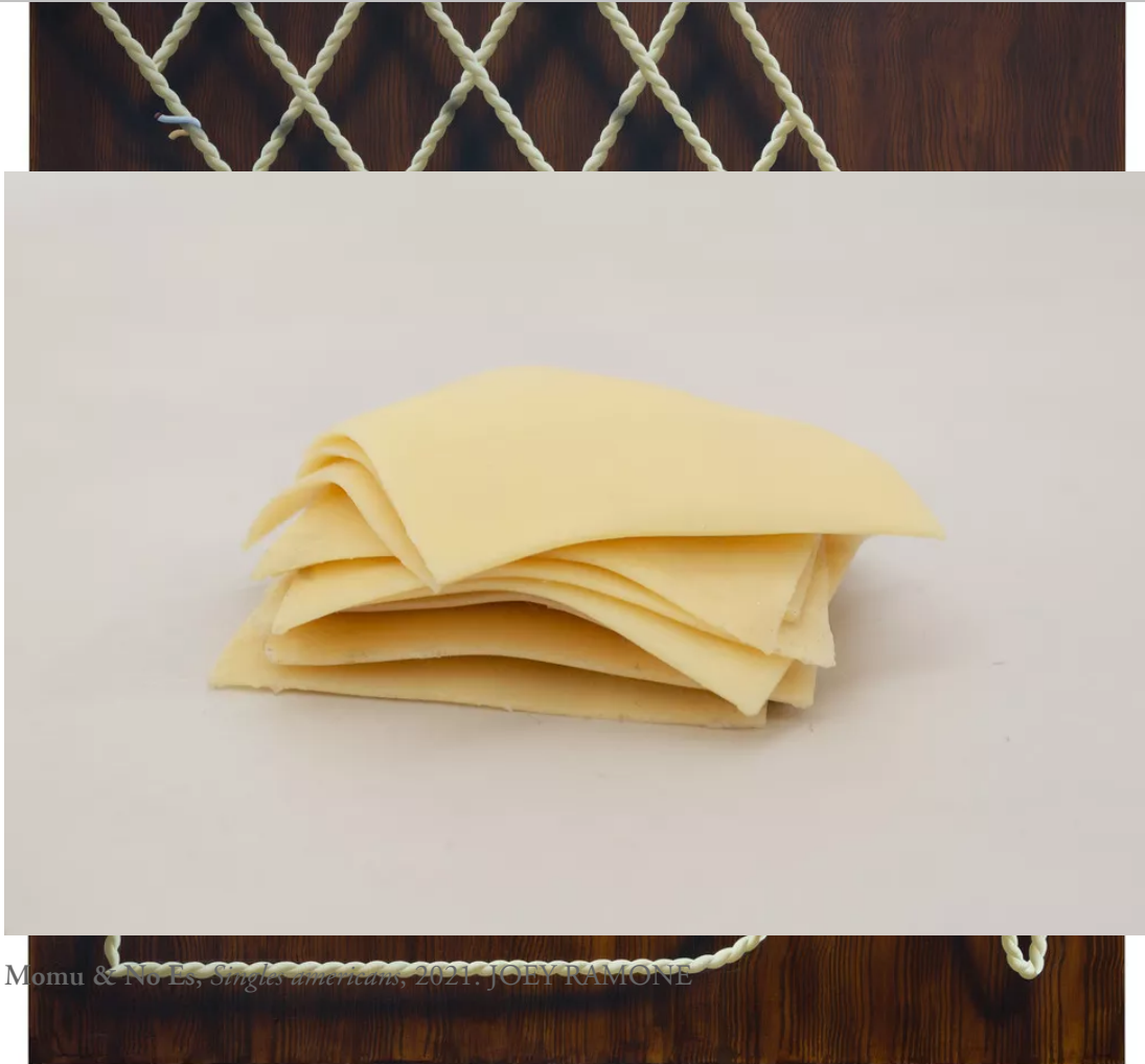
Momu & No Es, Singles americains , 2021. JOEY RAMONE