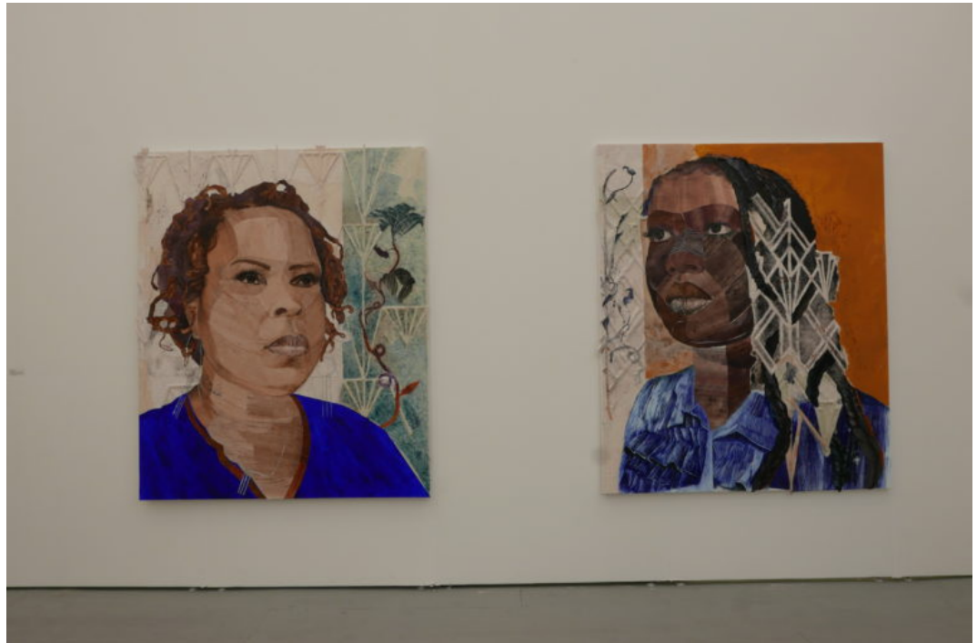
Works by Yashua Klos, photo by Eliza Jordan.

At Zidoun-Bossuyt Gallery , a work entitled The Spirit of a Hypocrite by Jeff Sonohouse popped from the wall in vibrant colors and textures, depicting a man with yellow spiky hair adorned in red-and-yellow checkered paint and blue eyeglasses dotted with puka shells instead of pupils.