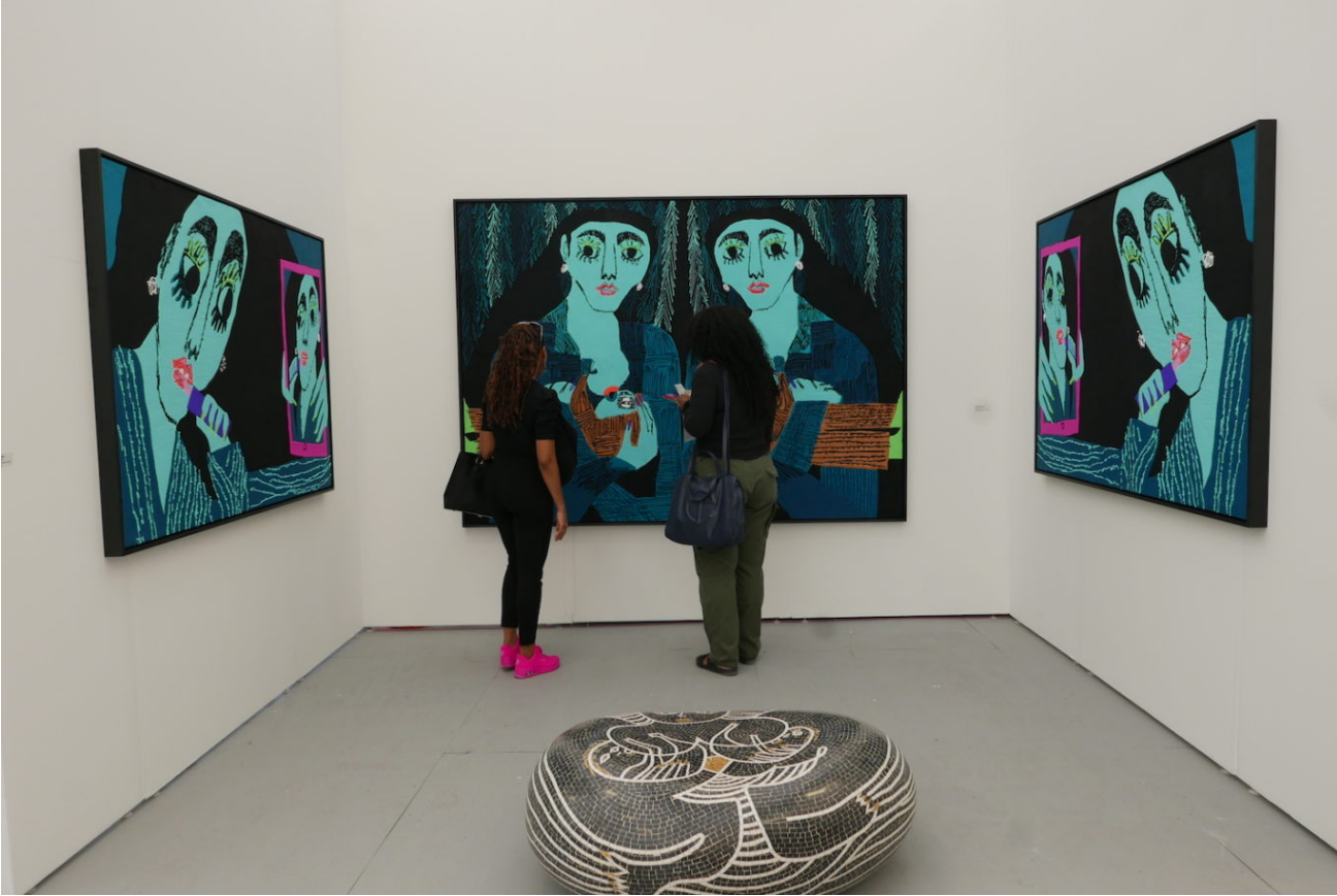
Zidoun-Bossuyt Gallery