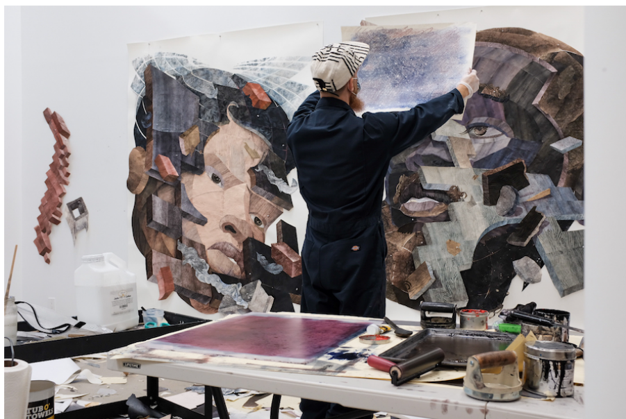
Artist Yashua Klos.

Yashua Klos is now represented by Zidoun-Bossuyt Gallery of Luxembourg. His first solo museum exhibition opens Feb. 12, 2022 at the Wellin Museum of Art at Hamilton College in Clinton, N.Y. Klos's first solo exhibition with the gallery is also slated for 2022. The Chicago-born artist lives and works in Brooklyn, N.Y.