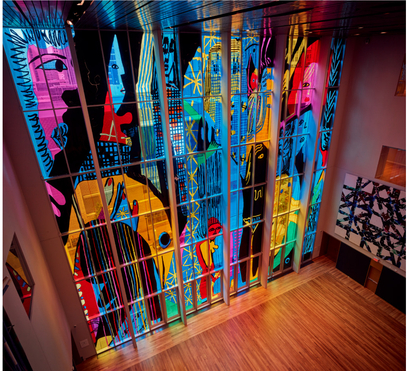
Foragers , 2020 colored vinyl on mylar, 805.5 x 738.5 inches