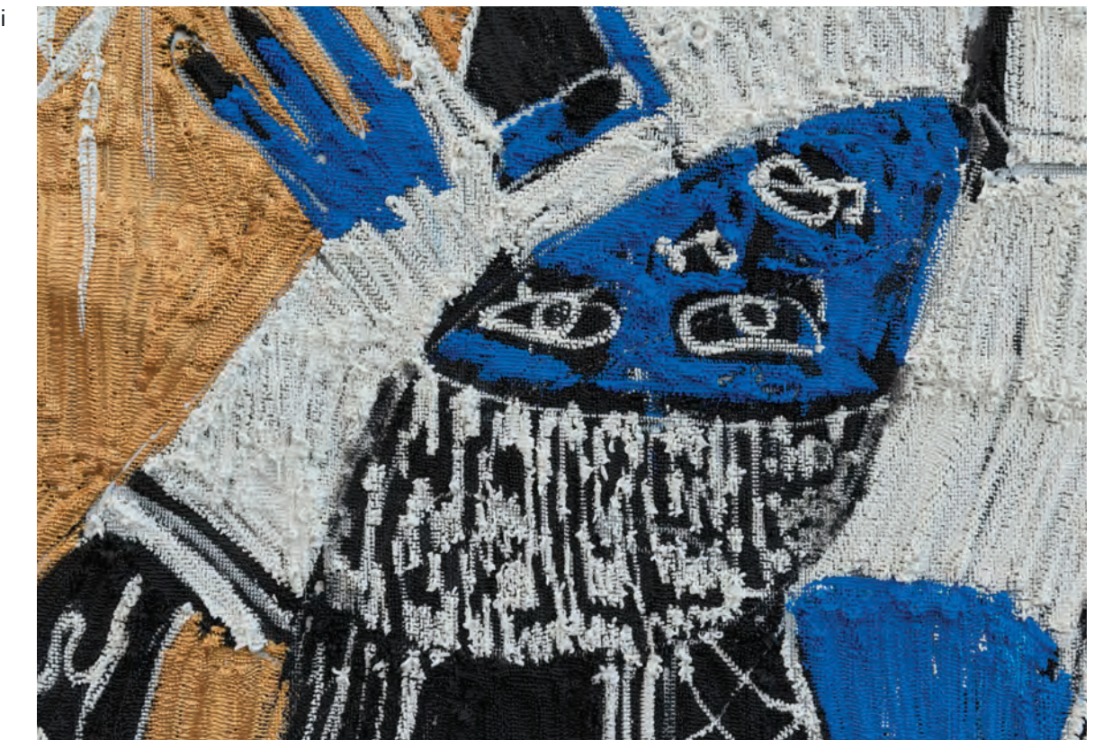
(i) Breadwinners, 2016, acrylic on aluminum mesh, 68 \times 96 inches. (ii) Detail of Pound, 2017, acrylic on aluminum mesh, 70 \times 48 inches.