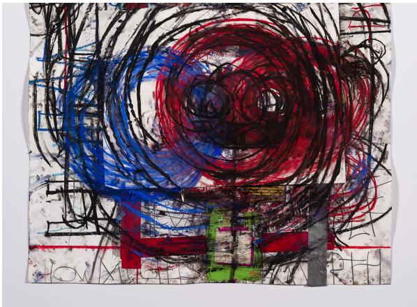
HOW MUCH WORTH (working title), 2020, pencil, charcoal, pastel, and collaged magazine, pages on paper, Paul McCarthy

The participating galleries are divided into different sections according to the artists on the show: PRIME (for mid-career and established artists), DISCOVERY (emerging artists), REDISCOVERY (artists where recognition is long overdue), INVITED (emerging galleries that are transcending the typical gallery format) and SOLO (solo artist presentations). Going beyond the different sections outlined in the fair, many of the galleries and artists participating in this year's edition of Art Brussels reflect a preoccupation with similar themes, ideas, and concepts, including but not limited to: gender, identity, and the body, climate and environment, and internet and technology. The key SOLO presentations will include Wanda Koop, Pétrel, Tuukka Tammisaari; Paul McCarthy, Dankyi Mensah, Jacques André, Natsuko Uchino, Philip Aguirre y Otegui, Noel W Anderson, and Nazanin Pouyandeh.