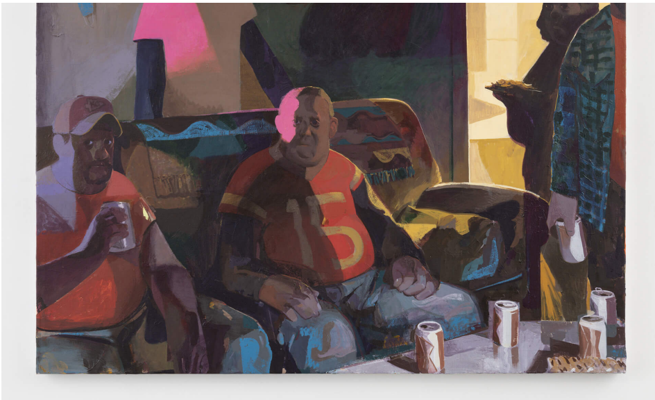
Super Bowl Sunday, Flashe and acrylic on canvas, 2021, Matt Bollinger

Art Brussels is scheduled to take place from April 28- May 1, 2022, in Belgium.