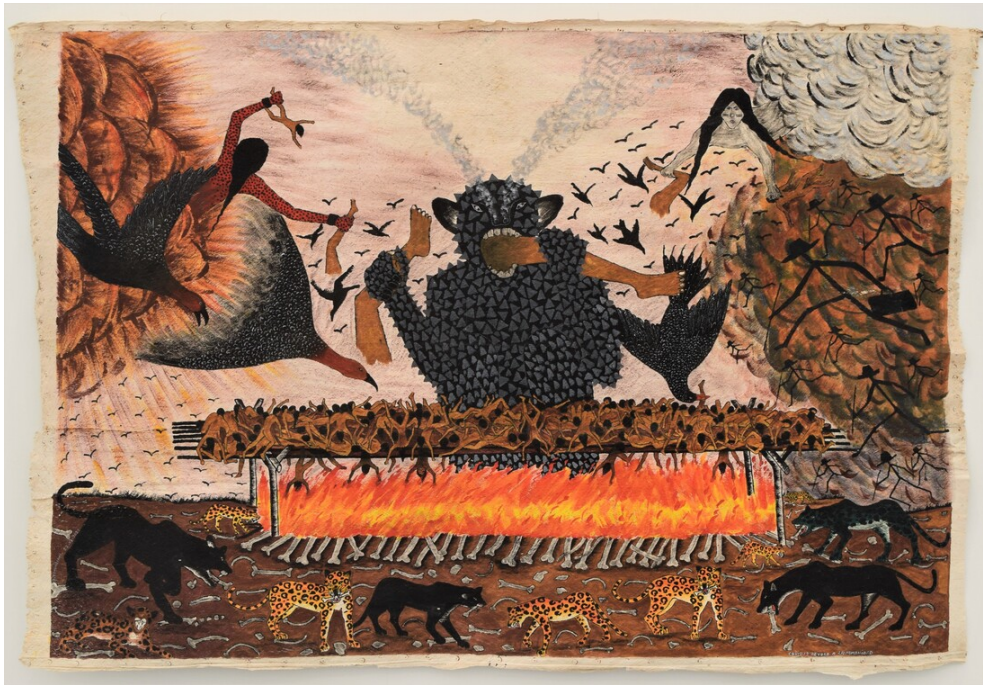
Covid-19 devora humanidad by Santiago Yahuarcani