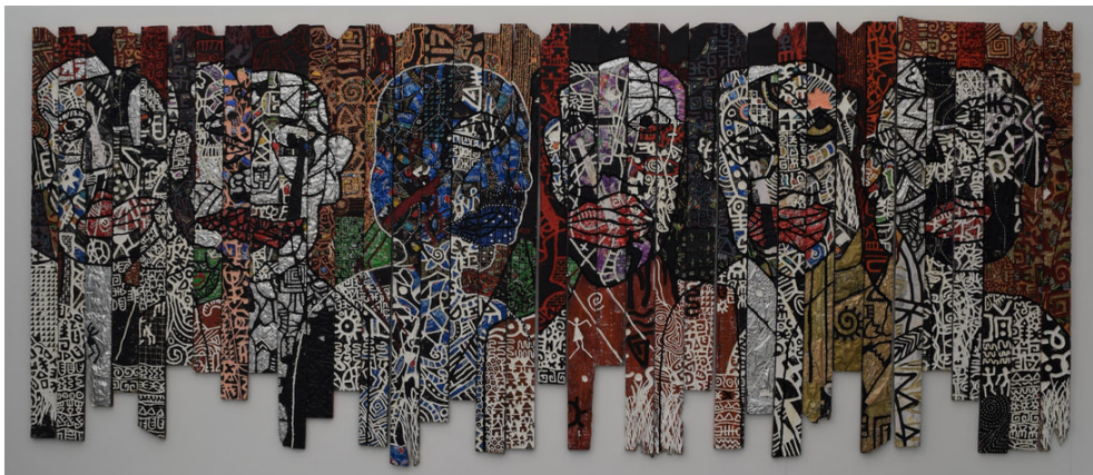
Kristin Hjellegjerde Gallery (UK, Norway, Germany)

The multi-national Kristin Hjellegjerde Gallery showed this piece and it is magnificent. Likely more than five feet across. I believe I overheard the person manning the booth telling a prospective buyer that it was made of recycled material. I can guess, from the website, who produced this but I don't like to guess. This happens all the time and usually I don't use the image but this was too spectacular for that.