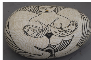
Mother Black, Mother Pink & Mother White by Summer Wheat