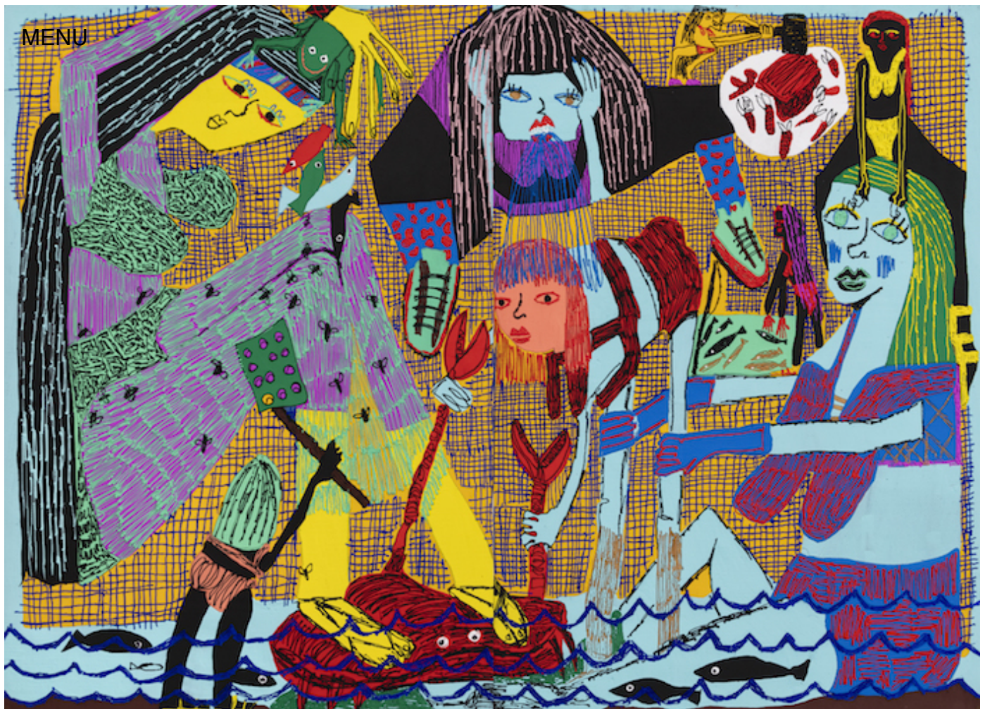
Summer L Wheat, Pulling Crab Legs, 2020, Zidoun-Bossuyt Gallery