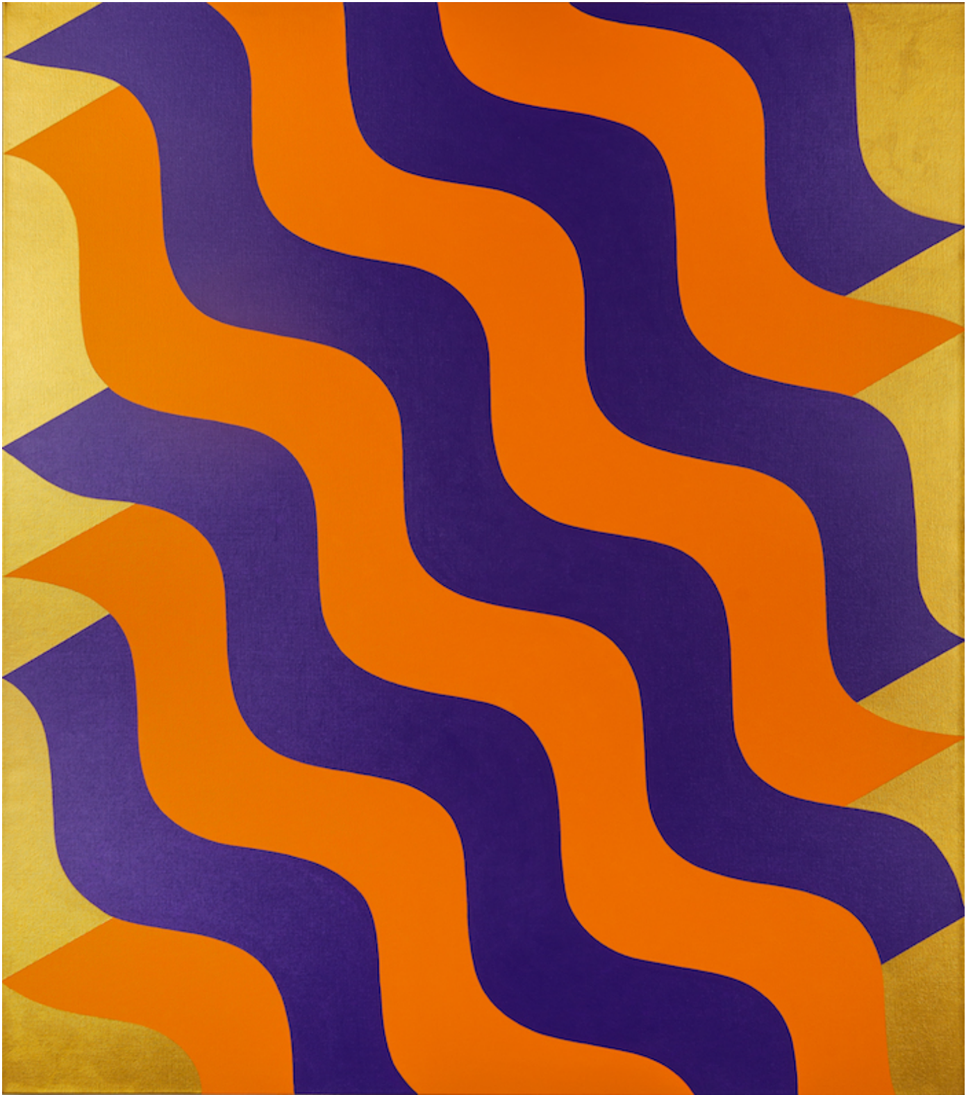
Mohamed Melehi, Moucharabieh, Purple and Orange, 2020, Lawrie Shabibi