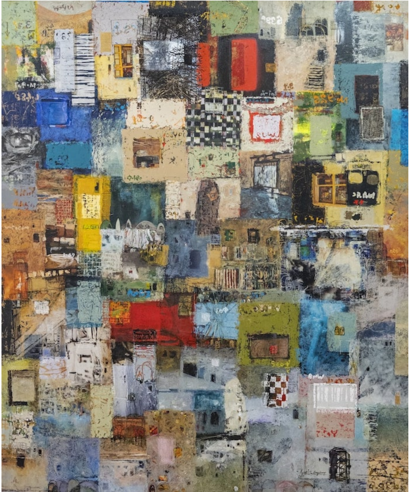
Addis Gezehagn, Floating City XIX, 2020, Addis Fine Art