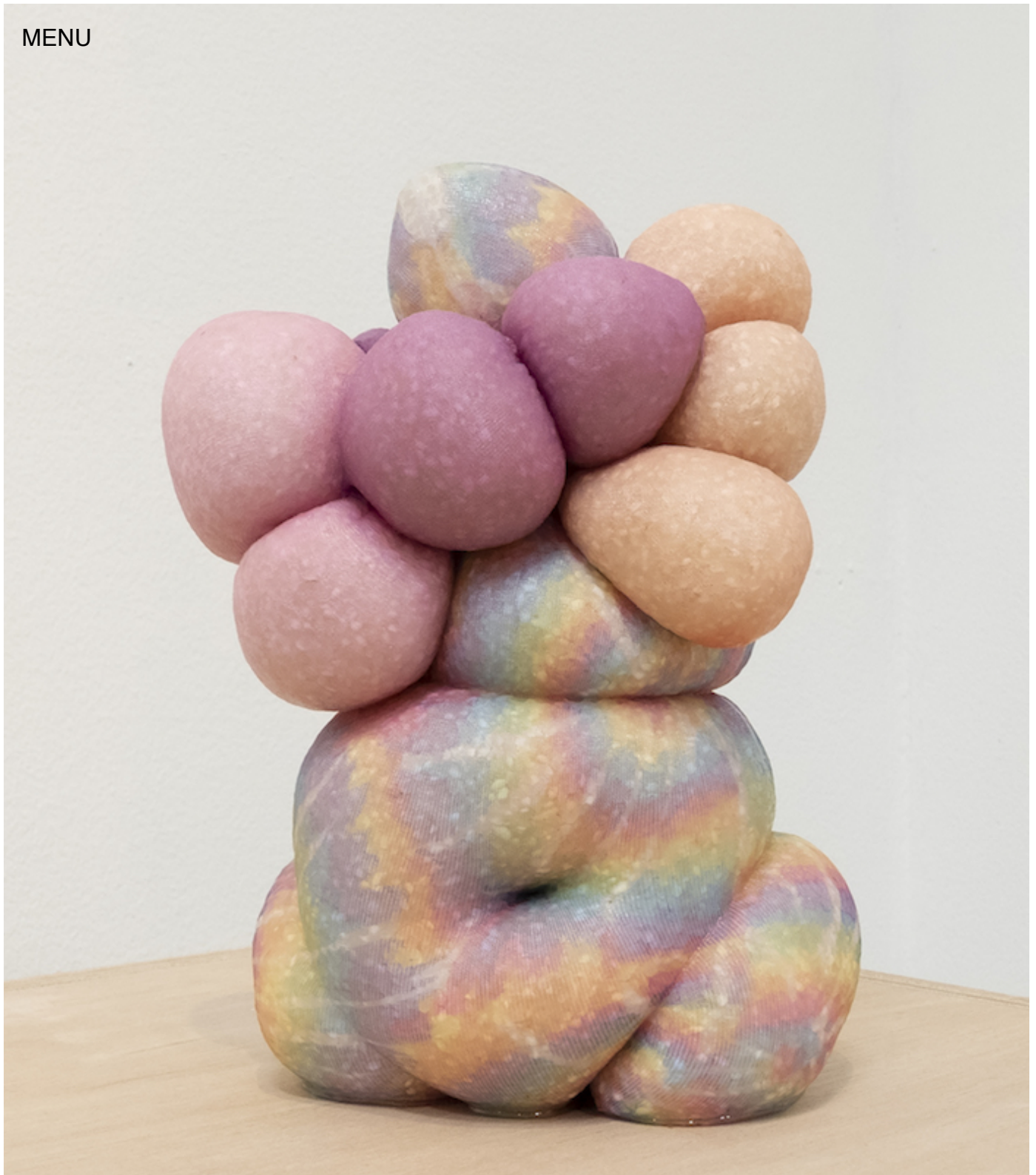
Hoda Tawakol, Mummy #7, 2020, Gallery Isabelle van den Eynde