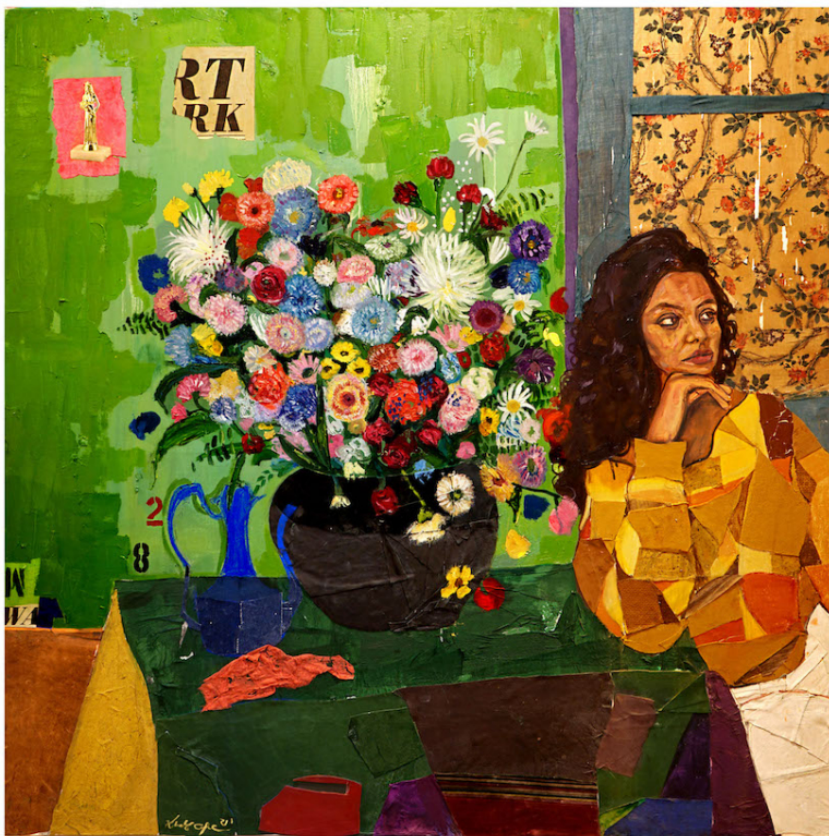
‘Siesta On Lexington ‘