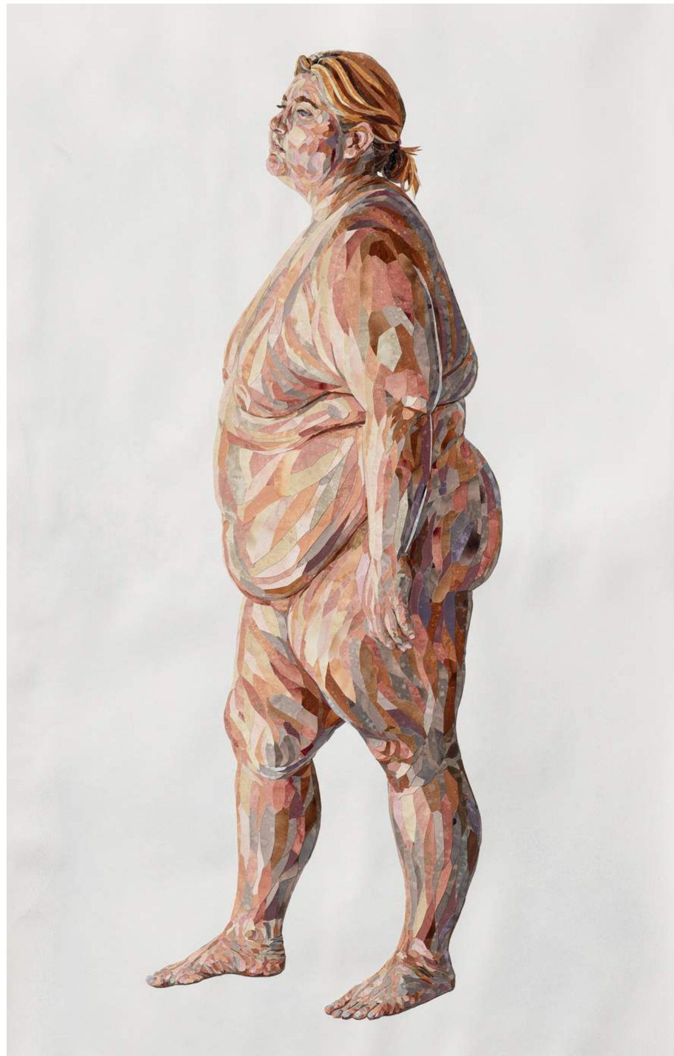
Philena #2 , 2023 Stained, washed and collaged watercolor paper on watercolor paper 167.6 x 106.7 cm (66 x 42 in) (YOL-010)