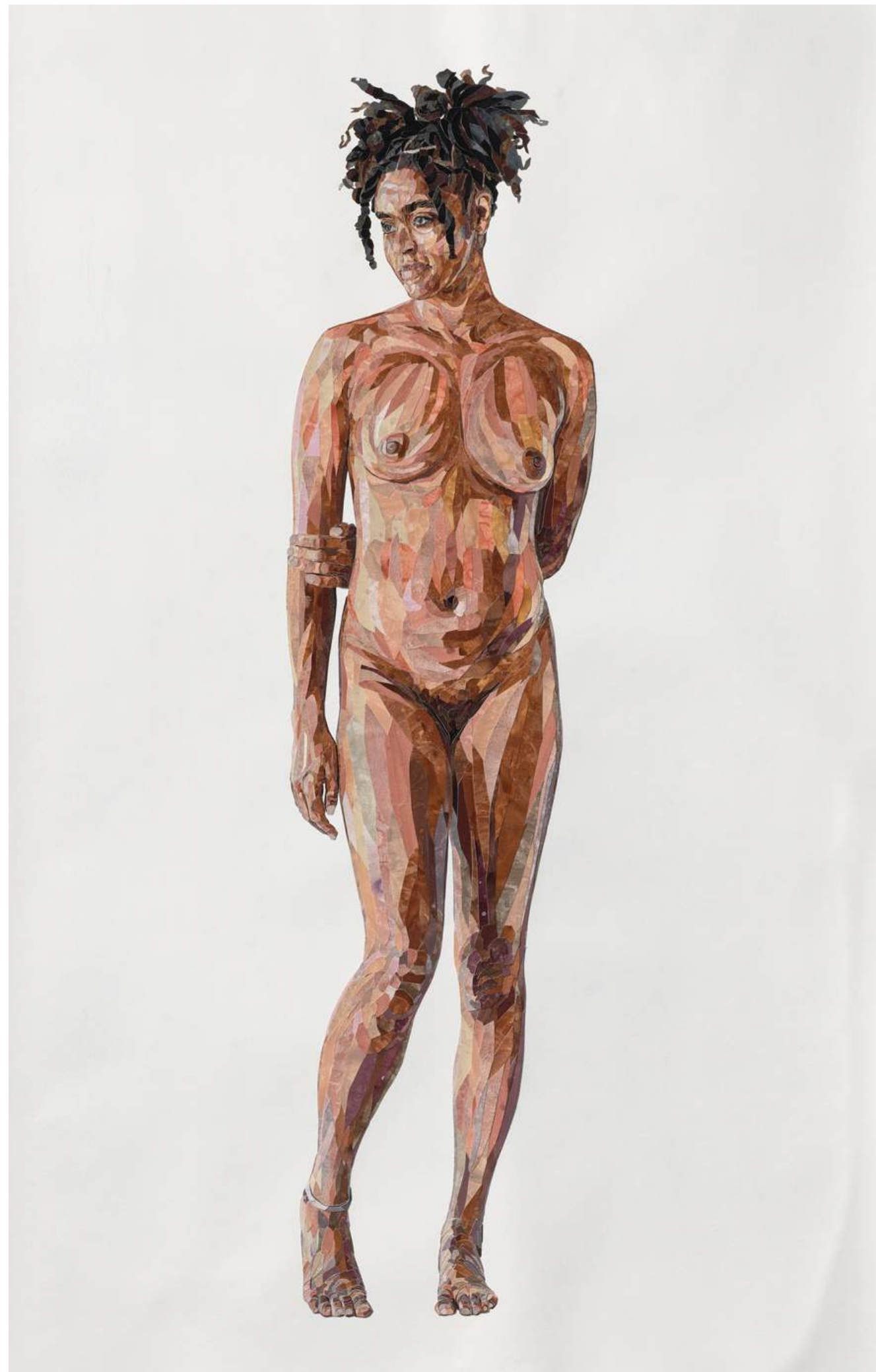
Alycia , 2023 Stained, washed and collaged watercolor paper on watercolor paper. 167.6 x 106.7 cm (66 x 42 in) (YOL-014)