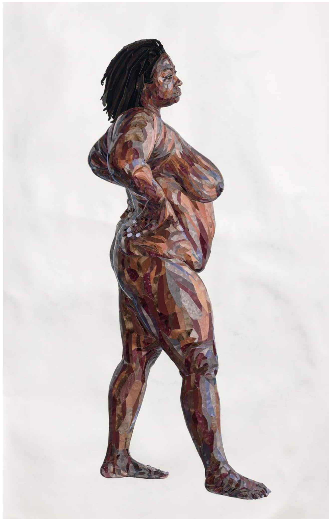
Jacqueline , 2023 Stained, washed and collaged watercolor paper on watercolor paper. 167.6 x 106.7 cm (66 x 42 in) (YOL-011)