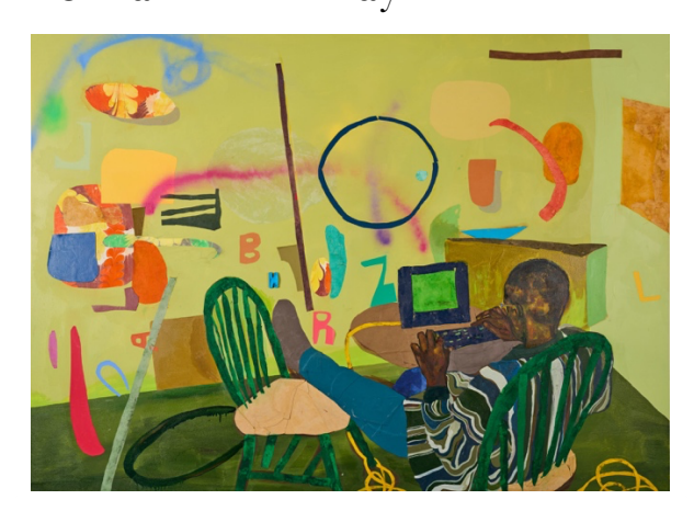
Yellow Chords, 2023, Oil, Pastel, Acrylic, Fabric, Handmade paper (abaca, cotton), Pleather, on canvas 150 x 209 cm (59 x 82 1/4 in)

Zidoun-Bossuyt Gallery presents Chilly Winds don't Blow , Khalif Tahir Thompson first solo exhibition in Paris, opening on Thursday 28 March 2024. On the occasion of the opening Khalif Tahir Thompson will be signing copies of his first monograph, published by Skira.